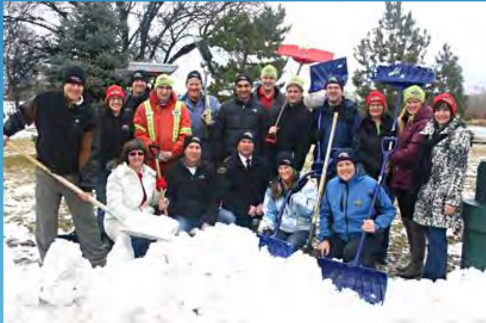
City of Kamloops, British Columbia Snow Angel Volunteers

Snow Angels are volunteers who clear snow from sidewalks, driveway entrances, and from paths to the service recipient's front door.